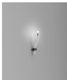
STRDU AP 1