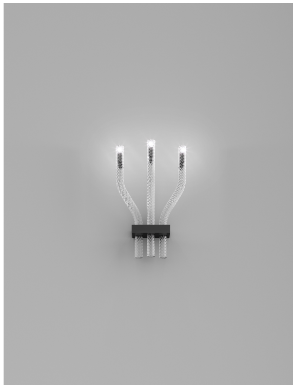
STRDU AP 3 CRRI NN G9 CE